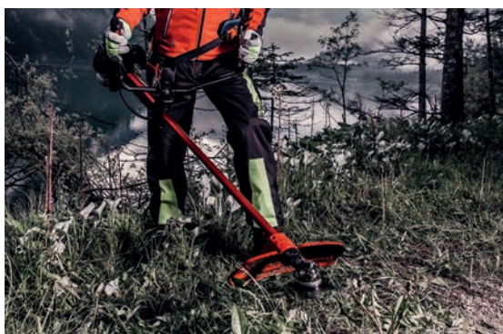
Garden and forestry technology 2023 / 24