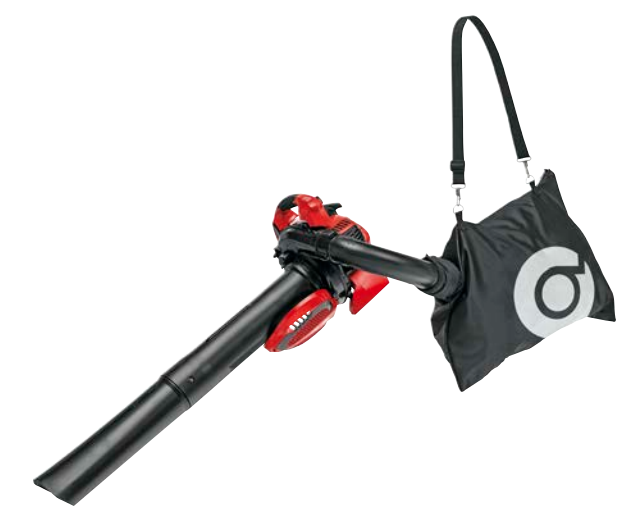
*Blower weight excludes any tubes/bag.