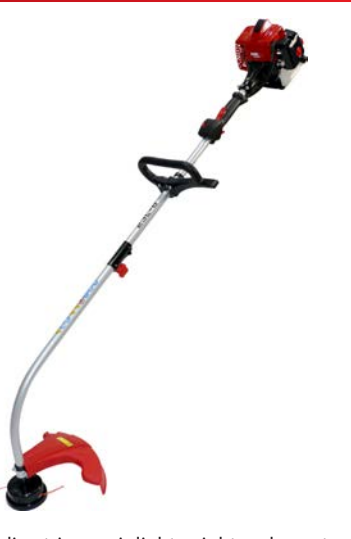
The 23L-B curved shaft line trimmer is lightweight and easy to use. The powerful 22.5cc 0.7kW engine features a soft start system that makes starting a breeze. The curved shaft is highly manoeuvrable, making it ideal for trimming around trees, along fence lines, and edging the lawn.