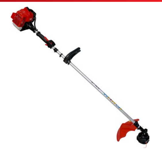
The 23L-S straight shaft loop handle line trimmer is lightweight, robust and easy to use. The powerful 22.5cc 0.7kW engine features a soft start system that makes starting effortless. The easy to load rapid feed line trimmer head and 3 tooth grass blade, which is perfect for dense growth, makes the 23L-S the ideal tool for home gardeners through to landscape professionals.